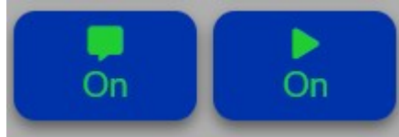
Message Pause and Play Pause Buttons

It is possible to inhibit message sending for all inputs via the portal using the 'Message Pause' button. Similarly, it is possible to switch off any output operation, such as 'Monitored Remote Controls' using the 'Play Pause' button.